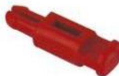
CR CDS coding pin