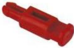
CR CDS coding pin